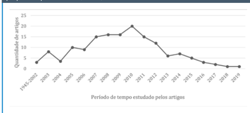
Graphic 1 – Period of epidemiological data studied by the articles

Most accidents involved male victims and of working age. The probable cause of this is the greater number of men performing activities that expose them to accidents, such as extractive activities. 9 As for the area where accidents occurred, it was mostly described as rural. However, there was great emphasis on periurban or unidentified regions. As for the rural area, the data obtained were as expected: they are, of course, the regions in which there is a greater existence of snakes in contact with