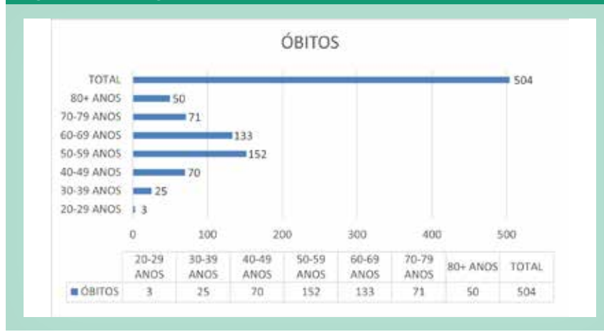
Figure 2 - Deaths due to Female Breast Cancer by age group in the Metropolitan Region of Porto Alegre between 2016 and 2018.

Note: the age group of 15 to 19 years was suppressed because they did not present deaths.