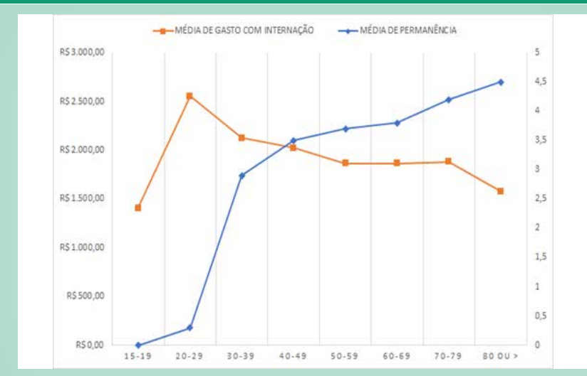
Figure 3. Comparison of average length of stay by age group and average value of hospitalizations for Female Breast Cancer in the Metropolitan Region of Porto Alegre between 2016 and 2018.